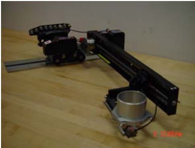
5085 scanner in a standard configuration, shown without cabling attached. Shown with manual skewing collar and spring loaded gimbal.

The Model 5085 is a remotely controlled automated scanner. It is designed to permit the deployment of a variety of sensing elements including ultrasonic transducers and eddy current probes and is compatible with all AMDATA data acquisition systems. It is designed for fast installation on a wide range of flat or curved surfaces. It uses magnetic wheels to mount to a variety of scanning tracks.