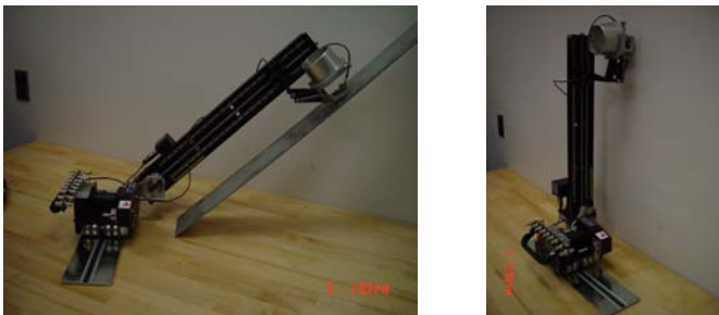
5085 scanner in a + 45° and + 90° orientation

The arm can be oriented straight out from the X-axis truck body at within an angle of \pm 90^\circ . This is useful when scanning vertical surfaces. Alternatively, it can be oriented transverse to the X-axis truck body in a "snowplow" mode. This is useful when scanning large areas that include the surface where the scanner wheels are mounted.